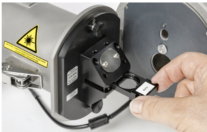
PCME QAL 260 shown with a multi-value Manual Audit Unit and attenuator

The automatic contamination check system (patent pending) ensures that any optical variances are measured, defined and adjusted to ensure zero and span drift is kept to a minimum.